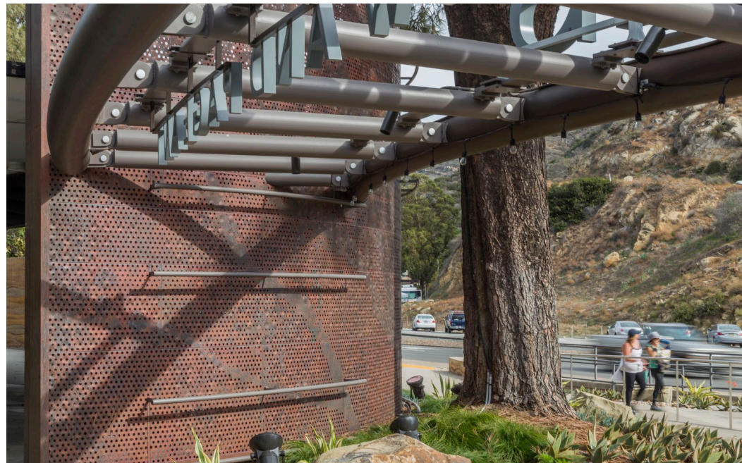
Above: Dirty Penny application for the Festival of the Arts in Laguna Beach, California.

For exteriors, this appearance will change over time. If sealed and maintained, it is possible for a custom copper patina such as Dirty Penny to maintain its iridescent luster. As an interior surface, the Dirty Penny copper's unique finish can last indefinitely, especially if the material is sealed.